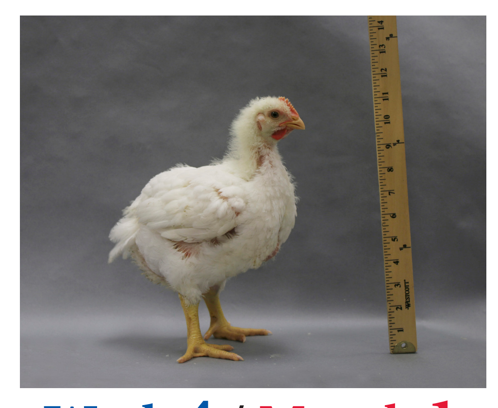
Week 4 / Month 1 Cockerels combs (on top of head) and wattles (under beak) start to grow larger than pullets.