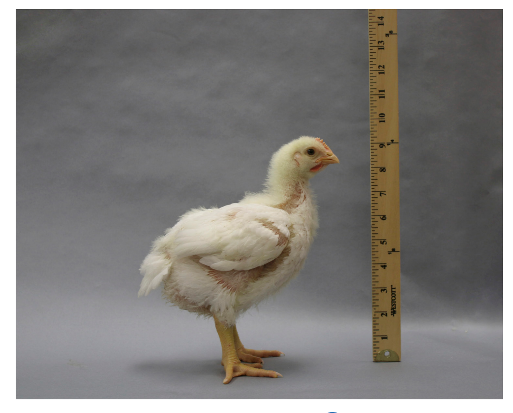
Week 3 The body is fully covered by feathers.