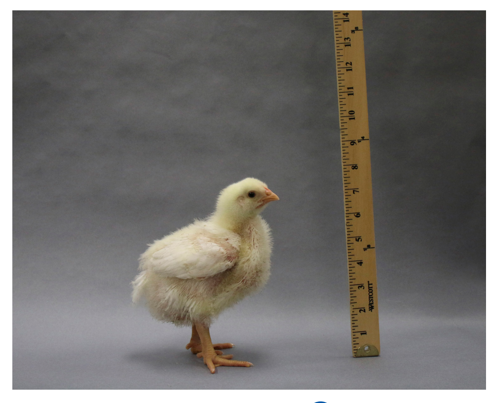
Week 2 Primary feathers start growing on their body and tail.