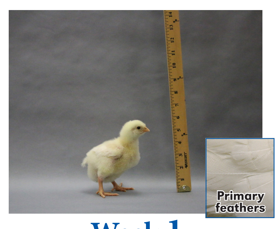
Week 1 Around 3 days, chicks start growing feathers called primary feathers on their wings.