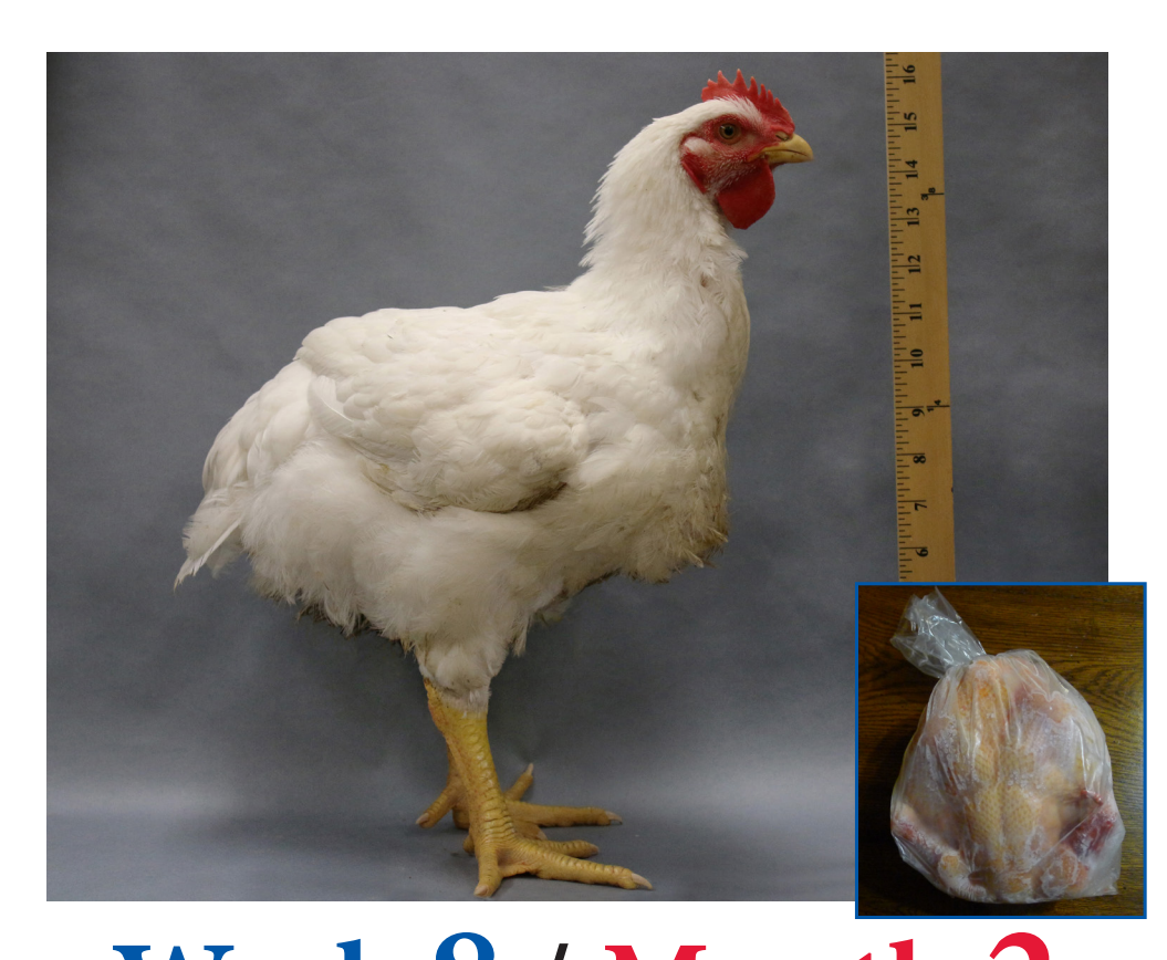
Week 8 / Month 2 Weighs about 9 pounds – ready to eat.