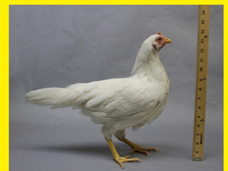
Week 12 / Month 3