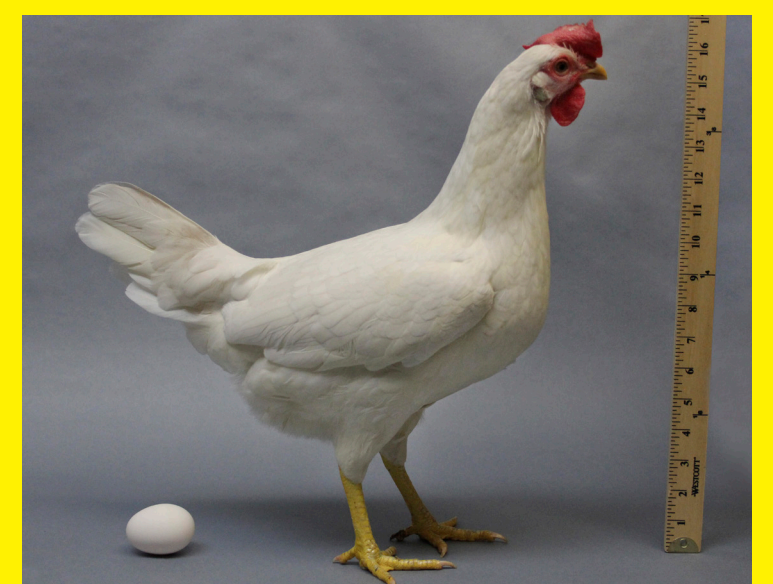
Month 6 Hen is fully grown and starts to lay eggs.