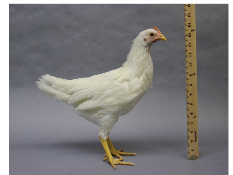
Week 8 / Month 2 Males start learning to crow.