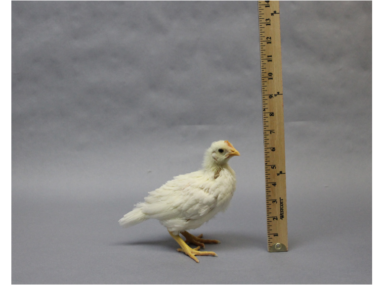
Week 3 The body is fully covered by feathers.