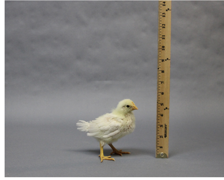
Week 2 Primary feathers start growing on their body and tail.