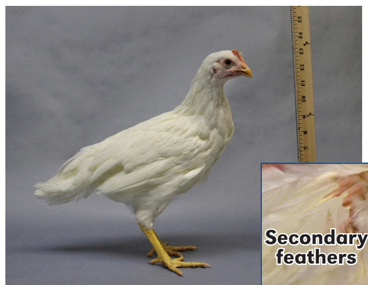
Week 9 Secondary feathers start replacing primary feathers.