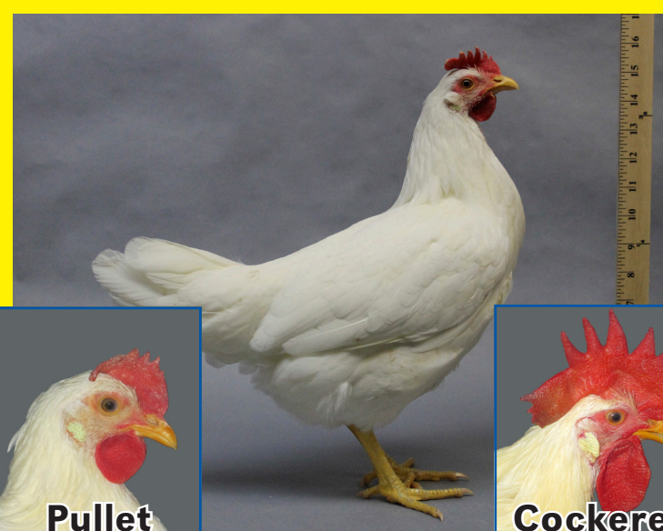
Month 5 Pullets combs start to get larger and turn red (some flop over).