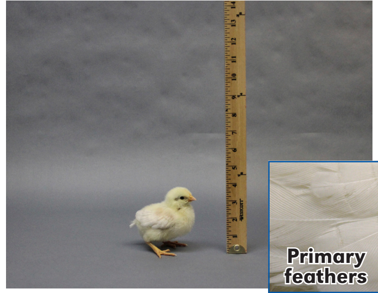
Week 1 Around 3 days, chicks start growing feathers called primary feathers on their wings.